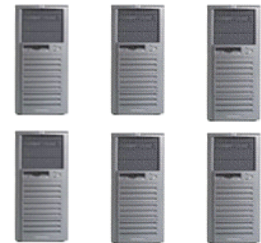
6 x HP ProLiant ML110