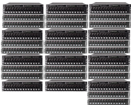
10 x HP MSA1000 w/20 x MSA30 (data) 2 x HP MSA1000 (log)