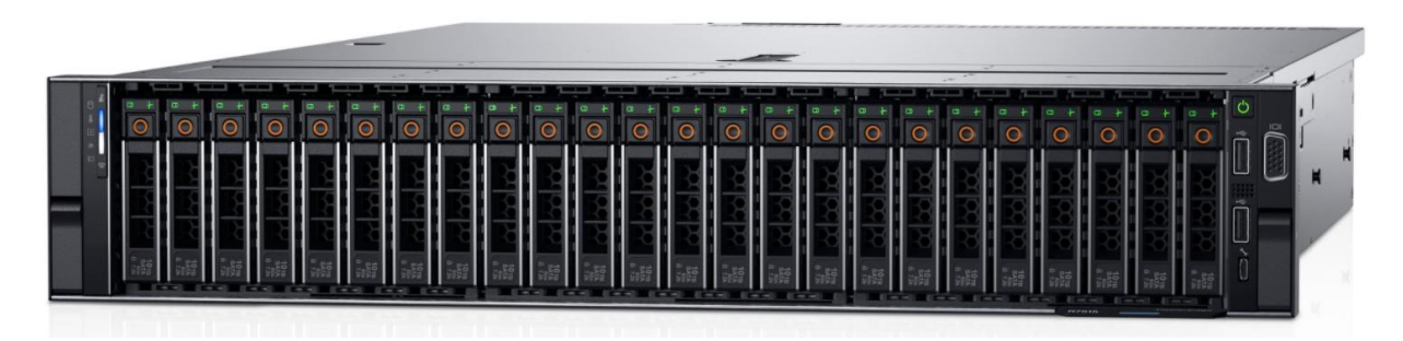
Fig0.1: R7515 Server

Figure 0.3 Benchmark and priced configuration for PowerEdge R7515 server