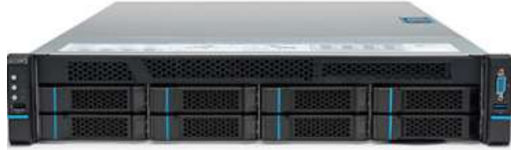
Figure 0.1: Benchmarked and Priced Configuration