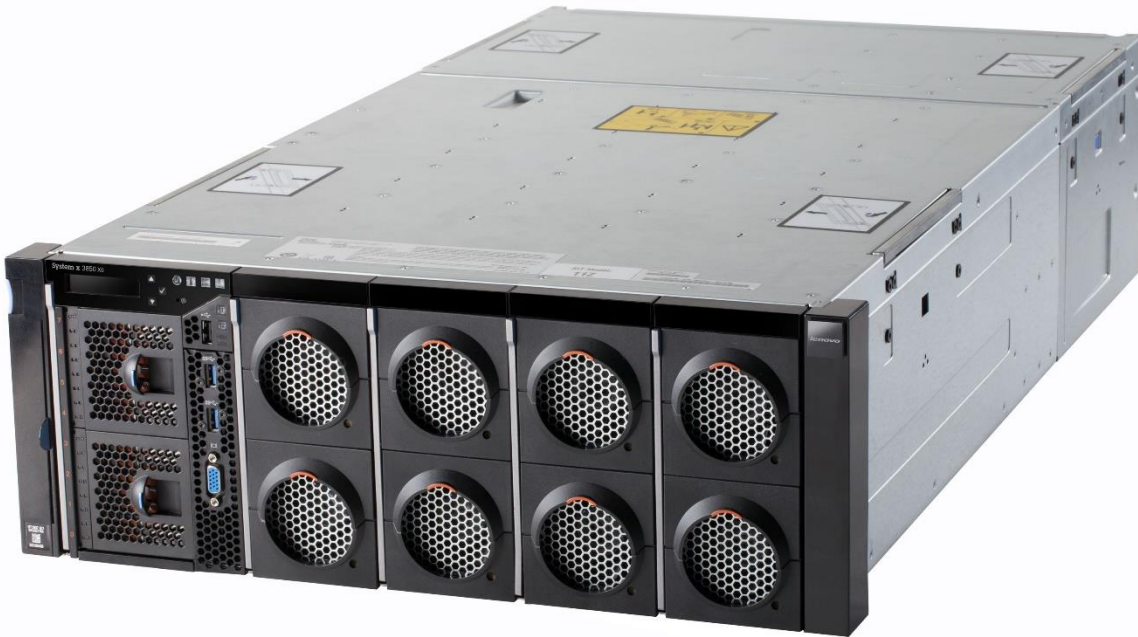
Lenovo System x3850 X6