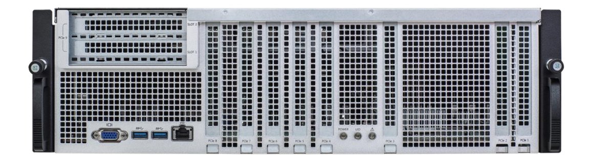
Figure 0.1 Benchmark and priced configuration for Inspur NF8380M5

Note: This system is the same system used for both the measured and priced configurations.