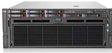
Figure 0.1 Benchmarked & Priced configuration

The server System Under Test (SUT), a HP ProLiant DL585 G7 , depicted in Figure 1.1, consisted of : 4x AMD Opteron 6167 SE 2.3GHz 12 core processors 512 GB of memory 1 x HP Smart Array P410i Controller 4 x HP 320GB SLC PCIe ioDrive Duo 4 x 72GB Pluggable 6G SAS 2.5" 15k rpm drives 4 x 300GB Pluggable 6G SAS 2.5" 10k rpm drives